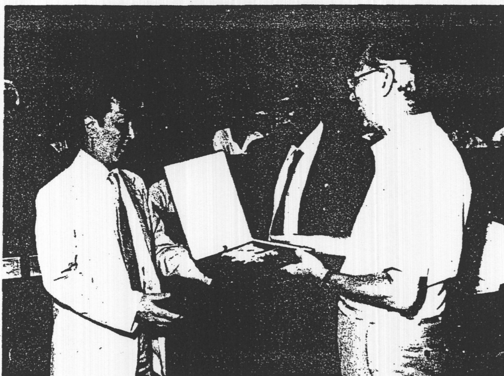
JAPAN/USA ICTP annually awards the Dirac Medal for significant achievements. Prof. Yoichiro Nambu of Japan (left) is shown here receiving the 1986 award from ICTP Director Abdus Salam (center) and Prof. Herwig Schopper, Director General of CERN in Geneva. Also receiving the 1986 medal was Prof. A. Polyakov of the USSR.

appointed by the Directors General of the IAEA and UNESCO in 1963, 1974, and 1983. Each meeting had an important impact on activities. The first of them, presided over by Prof. H. Casimir from Netherlands, recommended the introduction of mathematics and condensed matter physics as regular segments of the Centre's activity. The second, headed by Prof. L. Van Hove of the European Centre for Research (CERN), recommended a further extension of the programme to other disciplines, such as geophysics and